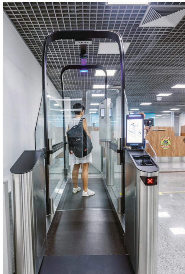
ImmSec gates at Salvador Airport, Brazil

The ImmSec's slim and ergonomic modules allow the gate to be installed in single or multiple lane configurations, with a minimal footprint when installed. There is also an ability to use a bidirectional function for staff as well as be used by PRM (Persons with Reduced Mobility), including standard and wide passage.