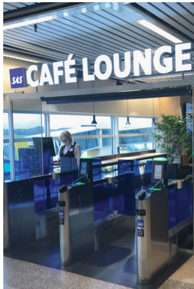
Lounge Access gates at Malmö Airport, Sweden

Combined with a biometric identification system such as a facial recognition camera, the Lounge Access AFL provides an even more convenient and simple access-check of passengers. The facial data can be captured while the passenger is approaching the gate and compared with the data stored in the airline or operator database. When enrolled it can also be compared with the data stored on the membership card.