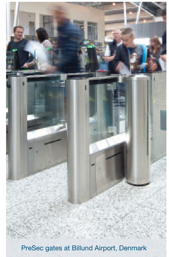
PreSec gates at Billund Airport, Denmark

With optional extension modules, it is even possible to use the PreSec gates for implementing a highly accurate queue management system.